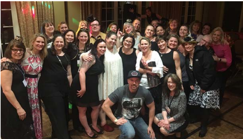
2017 Last Dance

Speaking of the dance party after the banquet, I've gotten to know many clerks over the years and the after party is a great place to learn more about them and mingle! If you don't know how to dance or you're self-conscious, get a table near the dance floor and enjoy the music. Feel free to laugh at and heckle me since I like to dance but I don't do it well! LOL