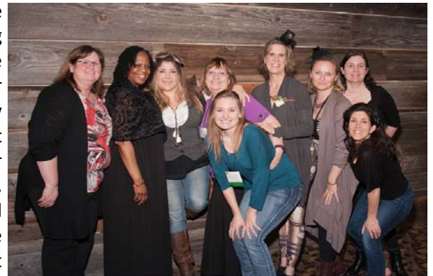
2017 Conference Group