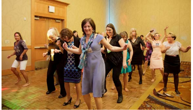
2015 Conference Dance Lessons

As you've read each month this year, the theme during my term is "Don't Sit Out the Dance". Besides attending our educational sessions, please come and stay at our President's Reception on Tuesday night, our auction night dinner followed by dance lessons on Wednesday, and our awards banquet and subsequent dance party on Thursday night. I promise you'll meet new people and some of them might end of being lifelong friends or colleagues you can count on to help you do your job better. And, you might just have some fun when you least expect it! I know you really want to learn the Cupid Shuffle and the truth is, it's actually the same three or four moves repeated through the whole song. So come and learn it!