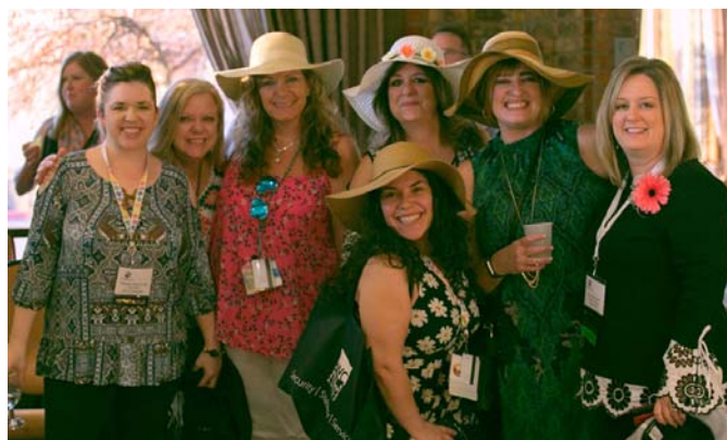
2018 Conference Group